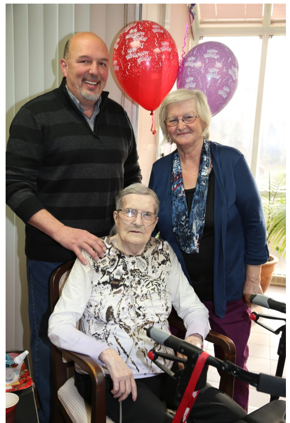
90 th Birthday